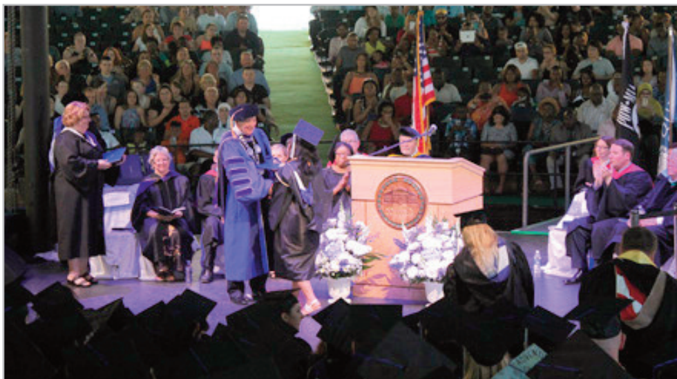
QC's 2015 Commencement Ceremony.

According to Chan, not all 600 students will attend the commencement at the South Shore Music Circus in Cohasset. But because each graduate is entitled to four guest tickets, Chan expects a full house at the venue, better known for its summer music concerts,